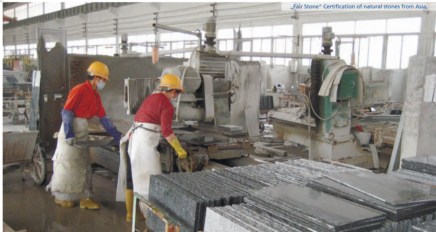
„Fair Stone“ Certification of natural stones from Asia.

Phone +49 (0)7021 – 726 99 54 Email info@win--win.com Internet www.win--win.com