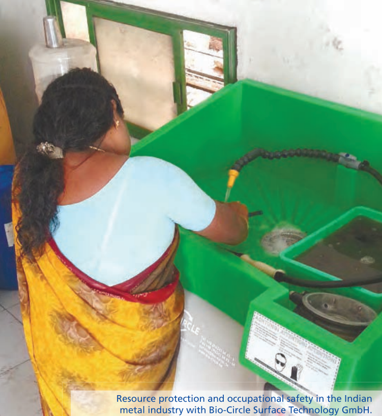
Resource protection and occupational safety in the Indian metal industry with Bio-Circle Surface Technology GmbH.